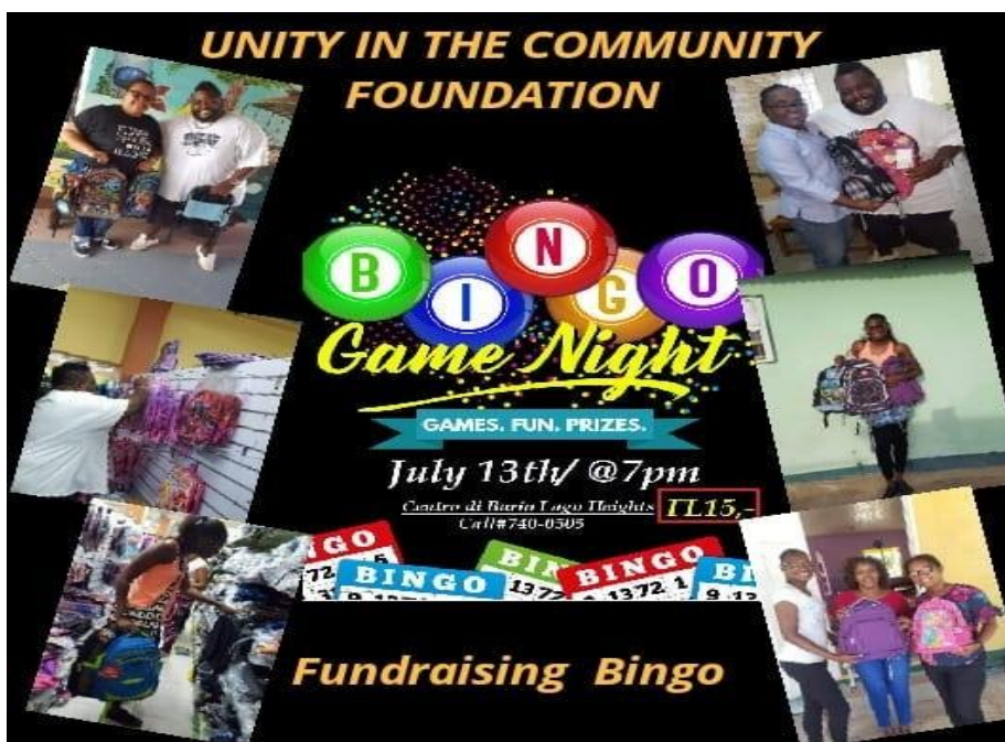
Bingo Time: July 13 th 7pm at Centro di barrio lago heights